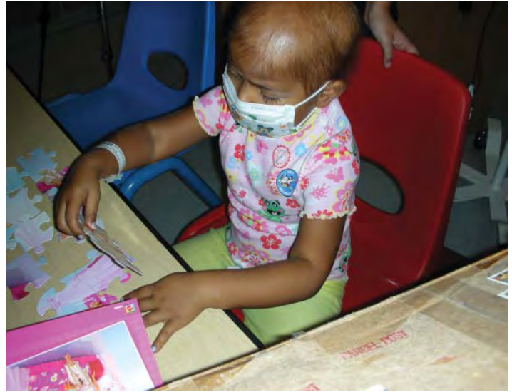
The hospital provides the very best of care and attention to thier young charges.