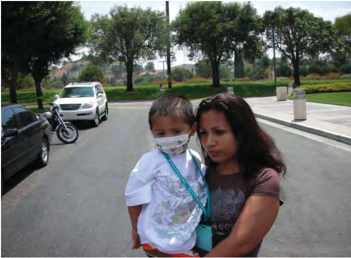
A protective mother warns her daughter about Submariners