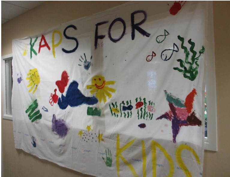
A banner Kids at St Rays made to welcome us

"We began by imagining that we are giving to them; we end by realizing that they have enriched us" Pope John Paul II