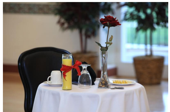
Photos taken at the Submarine Birthday Ball Monterey, CA