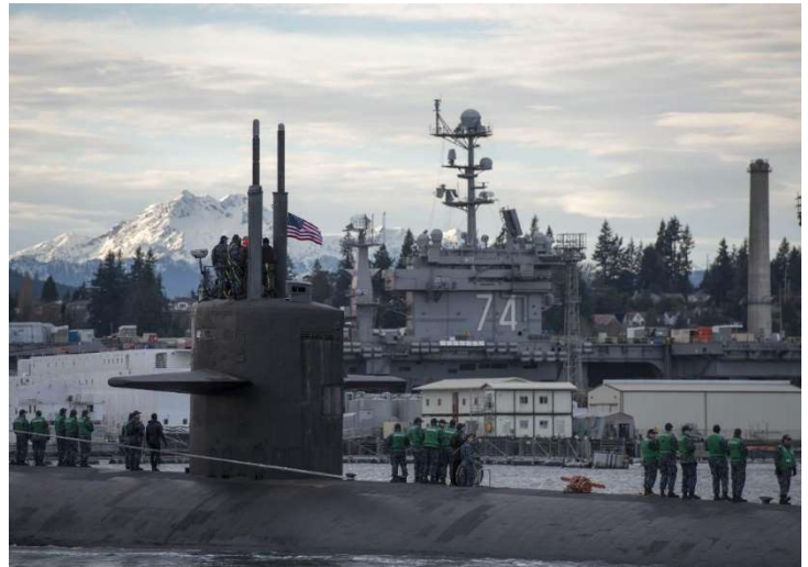
The Los Angeles-class fast-attack submarine USS Olympia (SSN-717) arrives at Puget Sound Naval Shipyard for a port visit in January 2017.

By: Sam LaGrone and Mallory Shelbourne and published at News.USNI.org on January 27, 2023 2:25 PM