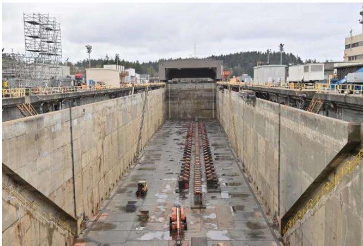
A photograph of the dry dock at Trident Refit Facility Bangor (TRFB). The dry dock is used to conduct hull maintenance on ballistic missile submarines and other work requiring a submarine to be out of the water.