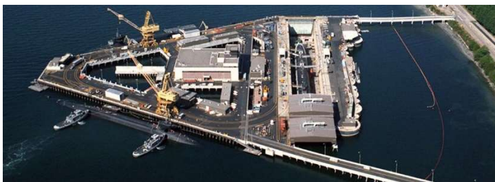
Undated photo of the TRF Bangor Delta pier

The Navy has for years known of the seismic risk to Puget Sound, as the facility sits on multiple fault lines, USNI News understands. It’s unclear what new information the Navy gleaned from the recent seismic assessment.