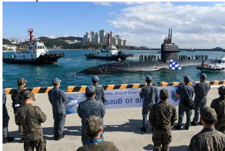
The Republic of Korea Navy sailors welcome the USS Key West as the ship prepares to moor in Busan, South Korea on Oct. 31. The sub completed its final deployment in November after serving the country for more than 35 years.

The Los Angeles-class submarine supported missions that include anti-submarine warfare, anti-surface ship warfare, surveillance and reconnaissance, and strike warfare, according to the Navy.