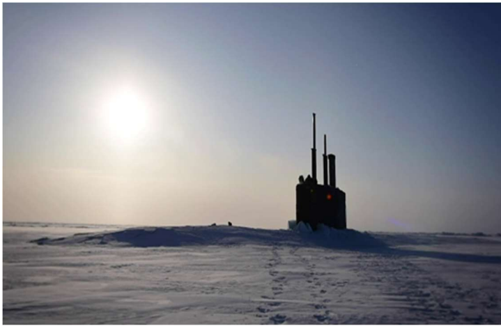
USS TOLEDO (SSN-769) arrives at Camp Seadragon – Ice Exercise (ICEX)