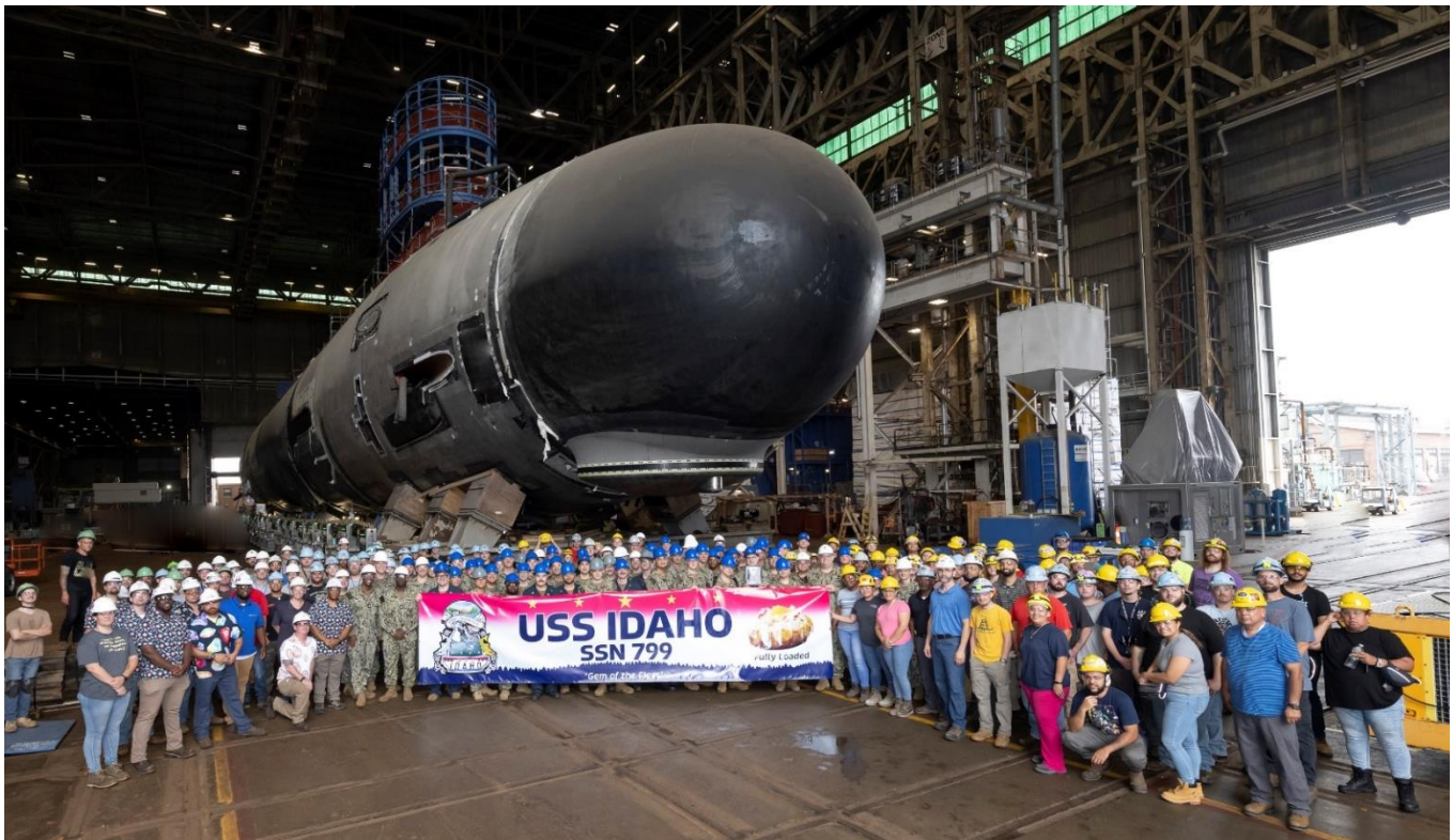
The USS IDAHO crew and Electric Boat employees in front of the future USS IDAHO SSN 799 in October 2023.

The Egyptian Theatre is presenting Idaho's Nuclear Navy on March 11 at 6:15 pm. This is a great presentation on the influence the early naval reactors had on the navy, and submarines in particular. Tickets are free and there will be a roundtable discussion following the movie. This movie is part of the history of these installations which are being removed. It's a great opportunity to view this on the big screen. Tickets available at this link: Idaho's Nuclear Navy